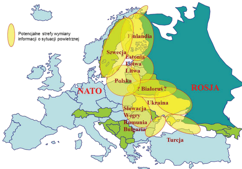
Figure 2. Expected CAI communication model on data sharing system

Expected CAI communication model on data sharing system: